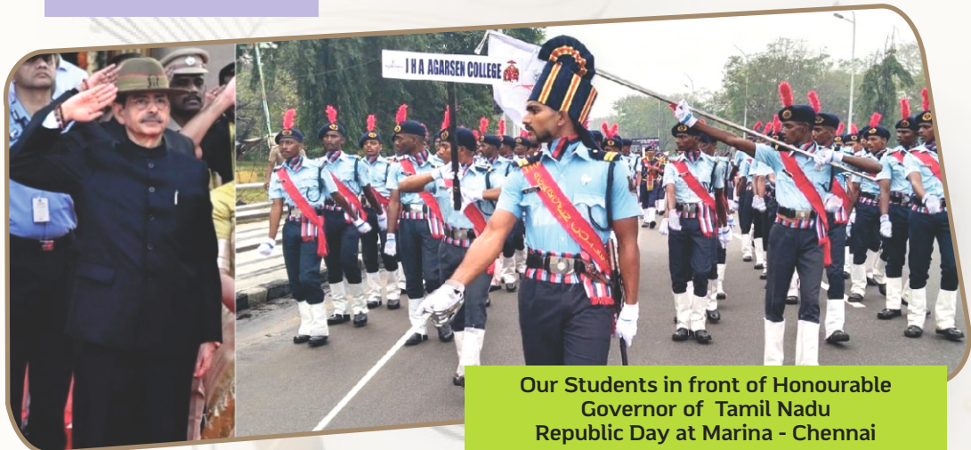
Our Students in front of Honourable Governor of Tamil Nadu Republic Day at Marina - Chennai