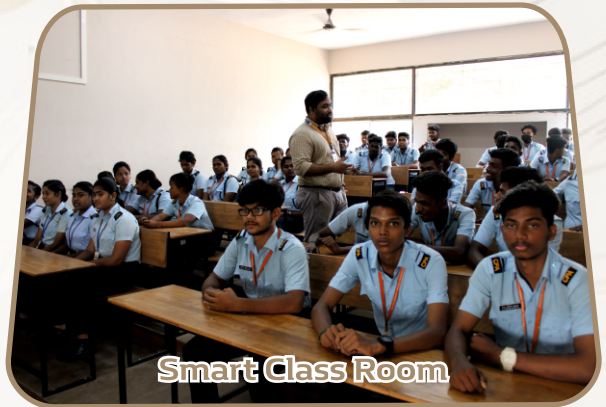
Smart Class Room