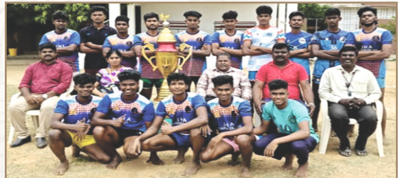
NAMO TROPHY WINNER DISTRICT LEVEL OPEN TOURNAMENT KABADDI.