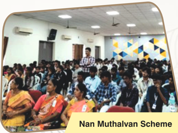
Nan Muthalvan Scheme