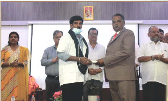
Free Eye Screening Camp by Agarwal Eye Hospital