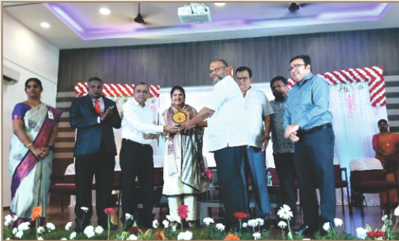
Inaugural Session of Agarsen Kala Gyan Utsav