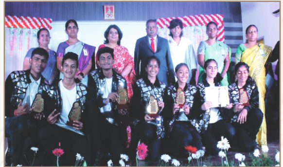
Valedictory Session of Agarsen Kala Gyan Utsav