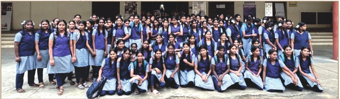
Campus Tour for the School Students [Educational Visit]