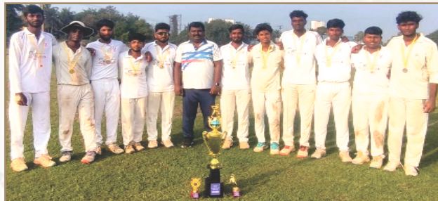
WINNER INTER - COLLEGE CRICKET ' TOURNAMENT AT ESHWAR CA GROUND, VANDALUR.