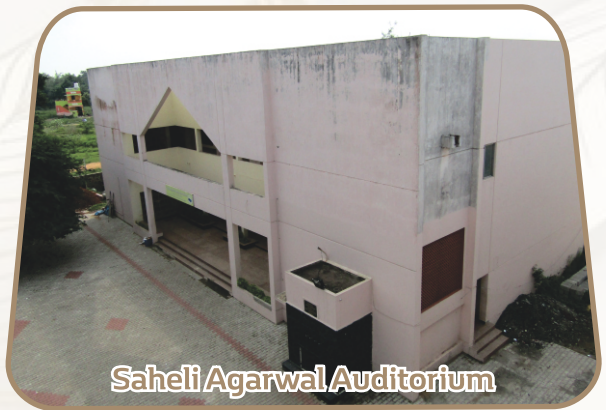
Saheli Agarwal Auditorium