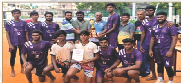
THIRD PLACE IN MADRAS UNIVERSITY B ZONE