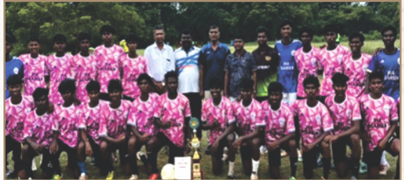
WINNER INTER - COLLEGE FOOT BALL TOURNAMENT AVICHI COLLEGE