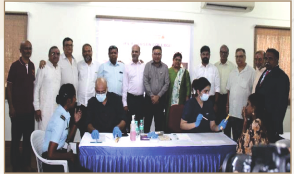
Free Dental Camp by Arista Dental Care